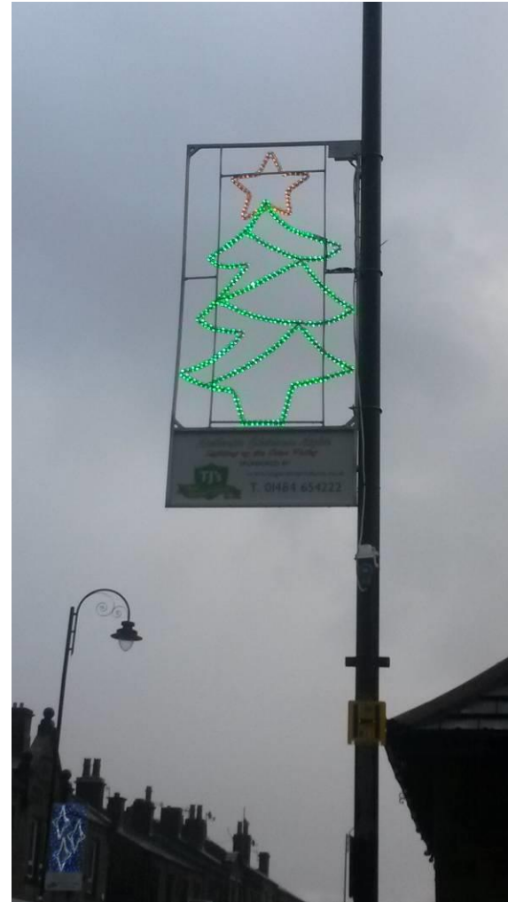
Rigging the lights in the pouring rain, November 2015