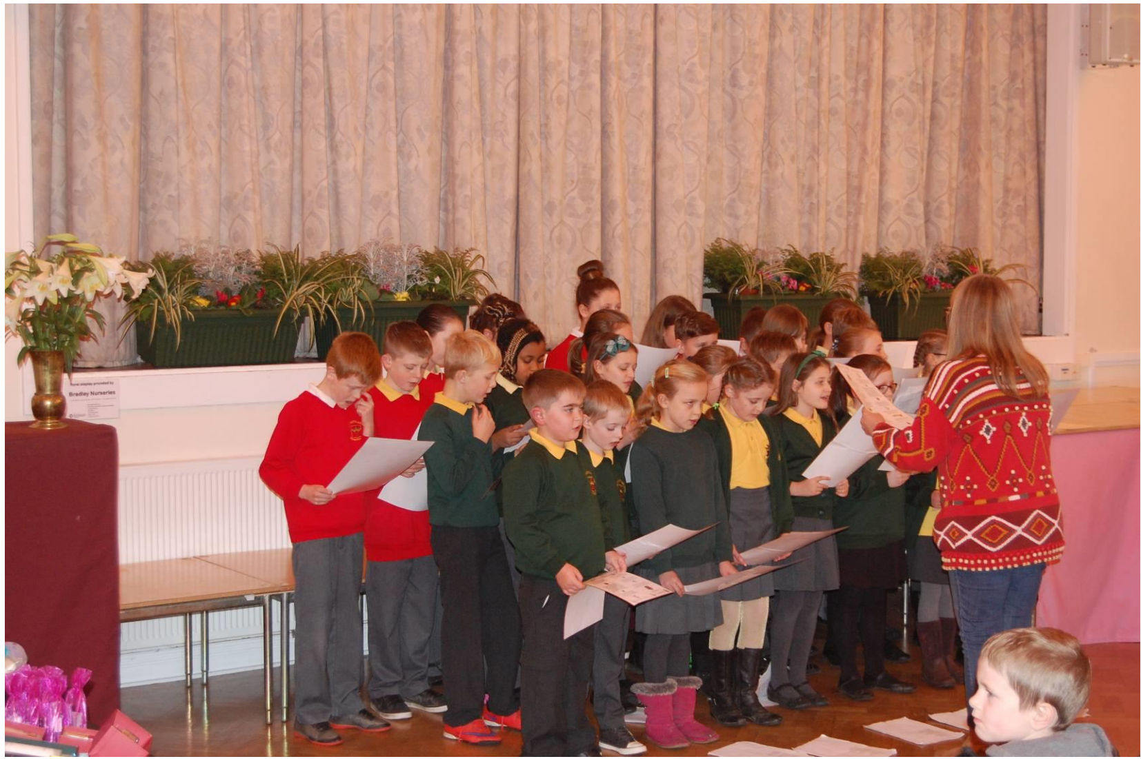
Linthwaite Ardron School Choir