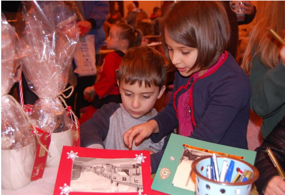
Making cards using old images of Linthwaite