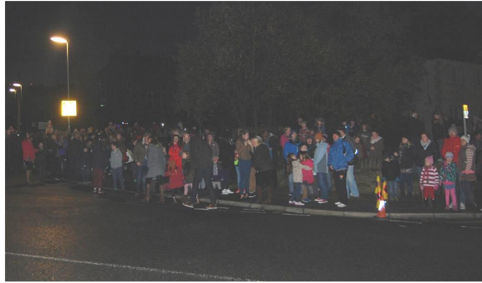
Outdoor event and switch on